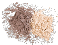
Neutral Ground #9784